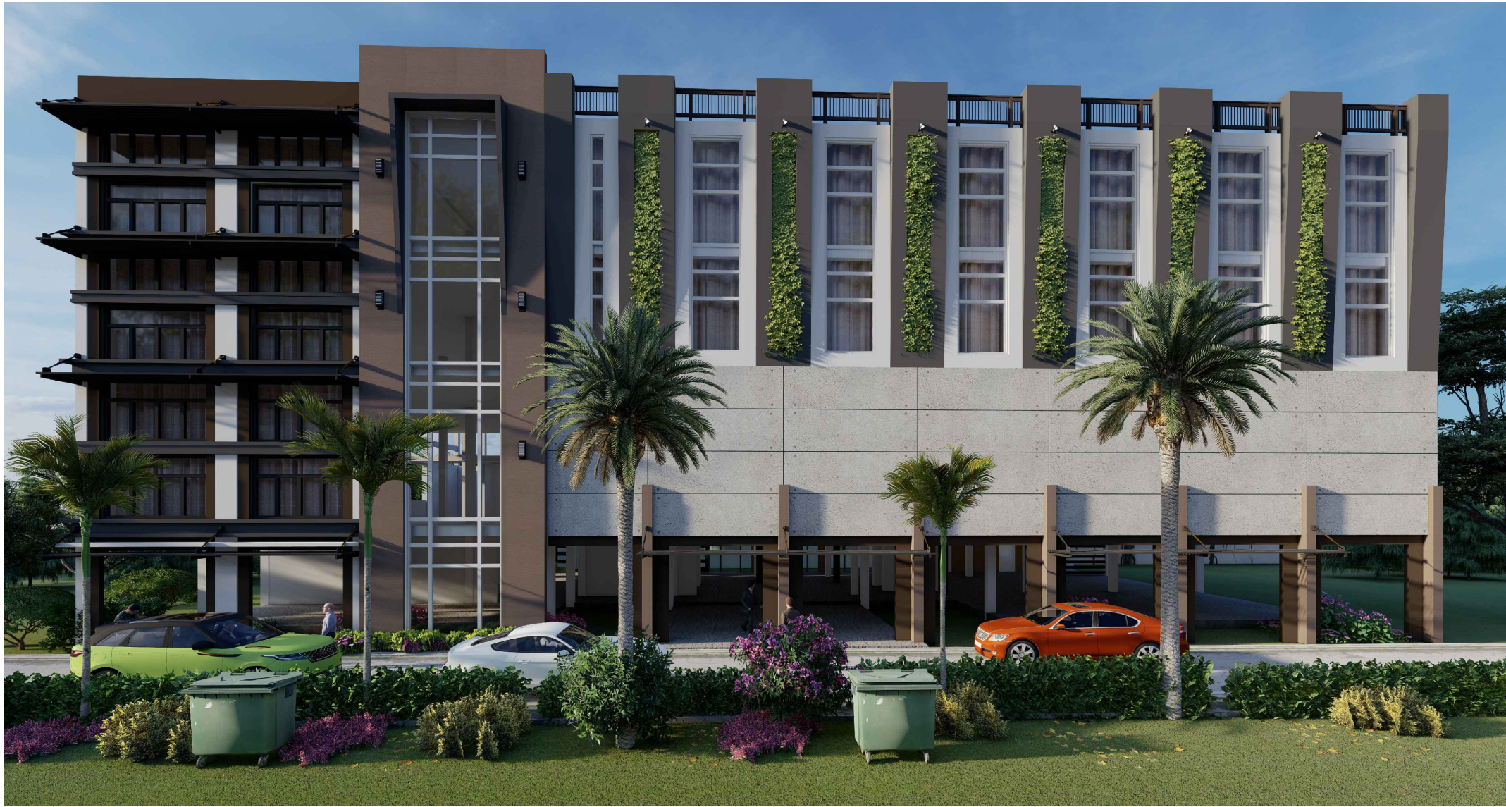
A PERSPECTIVE A-GS2-00 A-GS2-00 SCALE : NTS

NOTE : WRITTEN DIMENSIONS ON THESE DRAWINGS SHALL HAVE PRECEDENCE OVER SCALED DIMENSIONS. CONTRACTORS SHALL VERIFY AND BE RESPONSIBLE FOR ALL DIMENSIONS AND CONDITIONS ON THE JOB. THE DESIGNER MUST BE NOTIFIED IMMEDIATELY OF ANY VARIATIONS FROM THE DIMENSIONS AND CONDITIONS SHOWN BY THESE DRAWINGS.