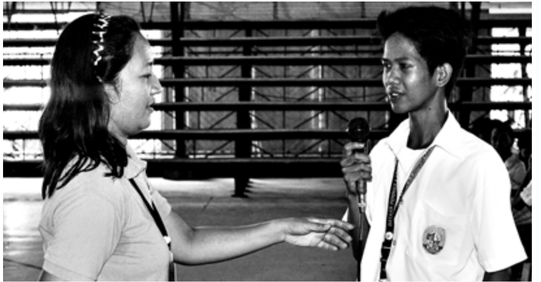
LET ME HEAR YOUR QUESTION. A representative from Department of Social Welfare and Development answers a question coming from an ESGP-PA scholar during the General Assembly.