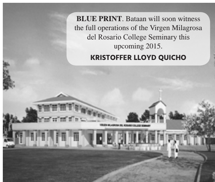
BLUE PRINT. Bataan will soon witness the full operations of the Virgen Milagrosa del Rosario College Seminary this upcoming 2015.