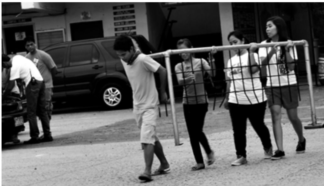
TEAM SPIRIT. Campus Student Council officers holds on to the railings as they transfer it to another area during their preparation for the BPSU Intramurals 2014: Believe.